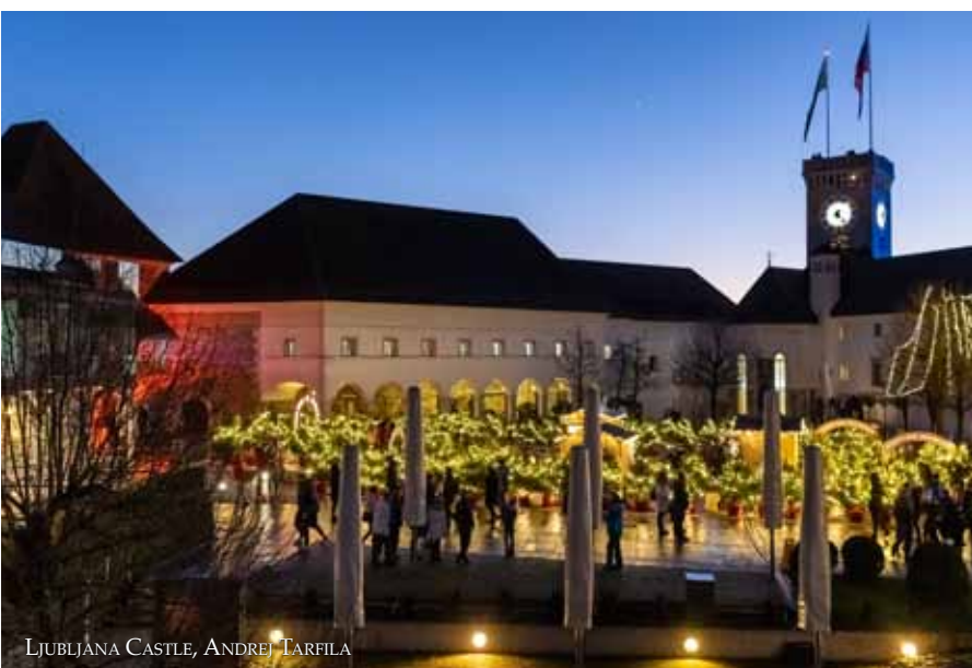
LJUBLJANA CASTLE