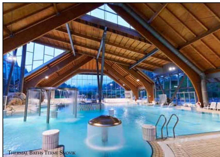
THERMAL BATHS TERME SNOVIK